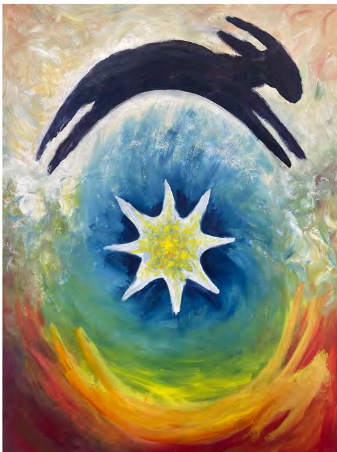
Cyrus Howard, Untitled, Oil on clay board 2023

A Guide to Requirements & General Procedures for Entering Frosh