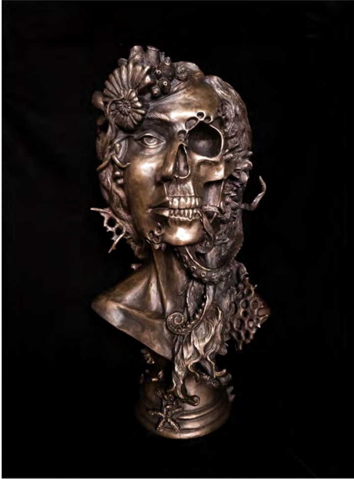
Courtney Scruggs, Scylla, Bronze, 2021