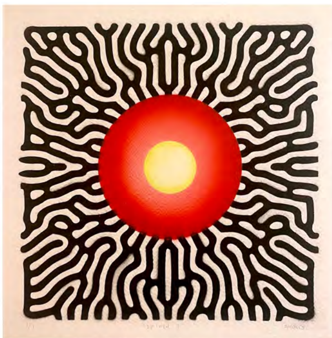
d, Acrylic on Paper, 2022

A Guide to Requirements & General Procedures for Entering Junior Transfer Students