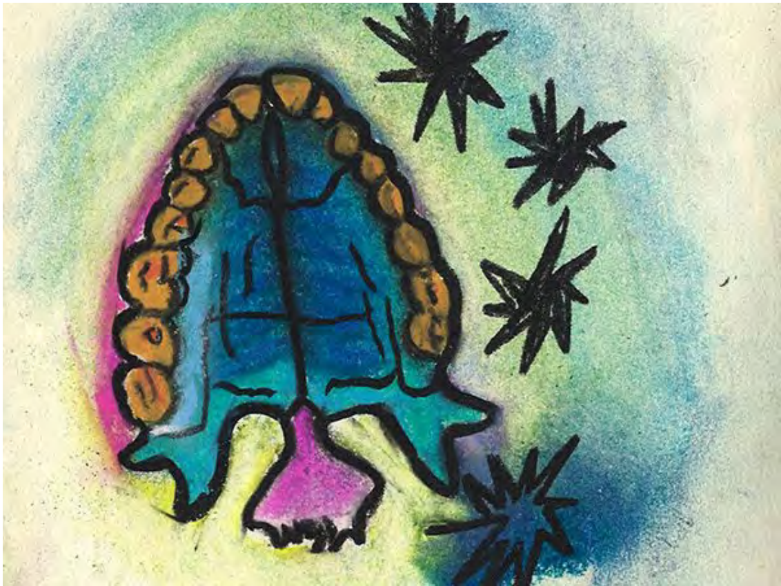
Photo: Uarê Erremays – Nossa Voz publication cover drawing. Issue: Céu da Boca (The Sky of the Mouth)