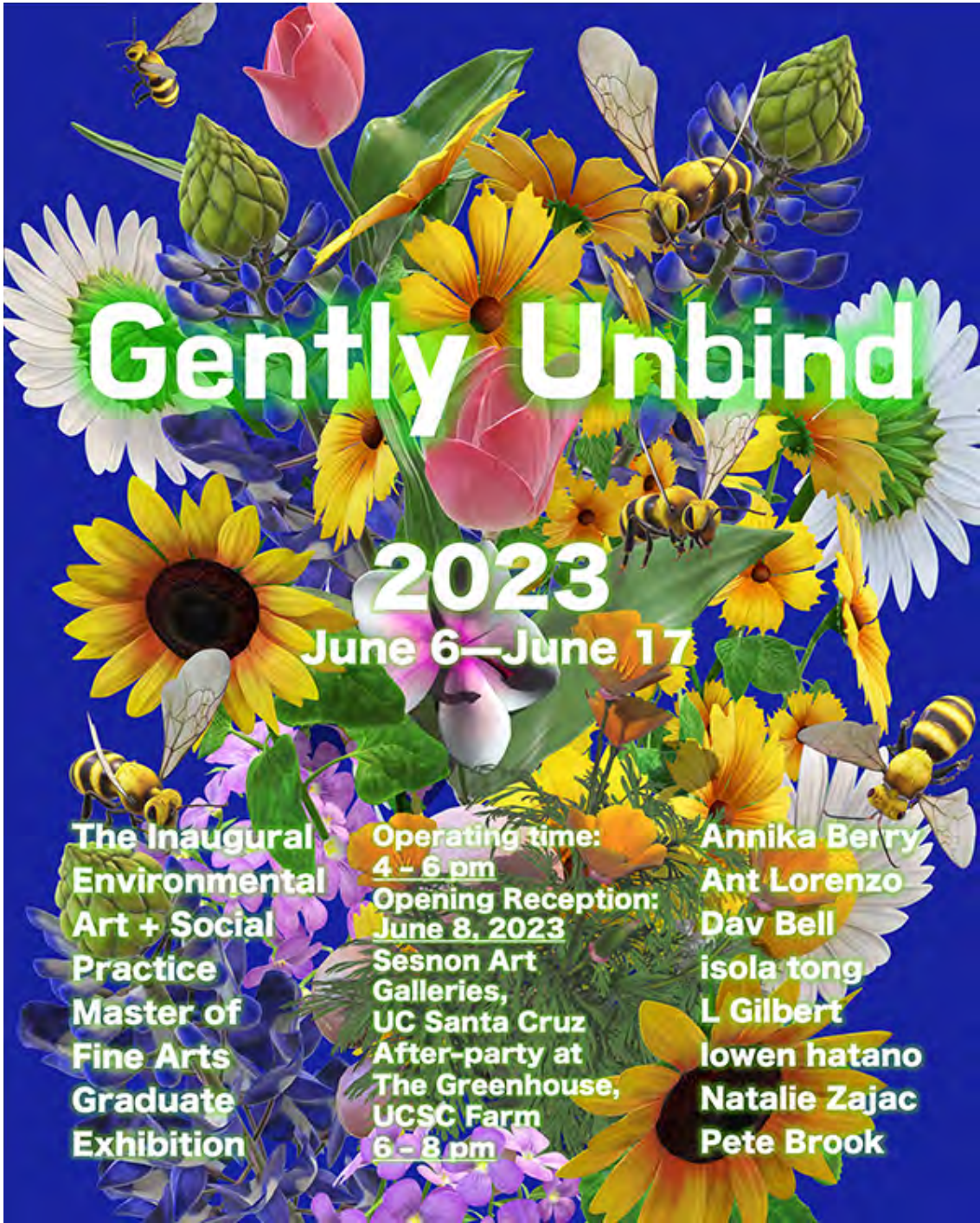
Image: Environmental Art + Social Practice MFA Exhibition's Poster.